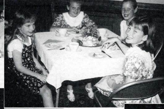
Doll Collection admired