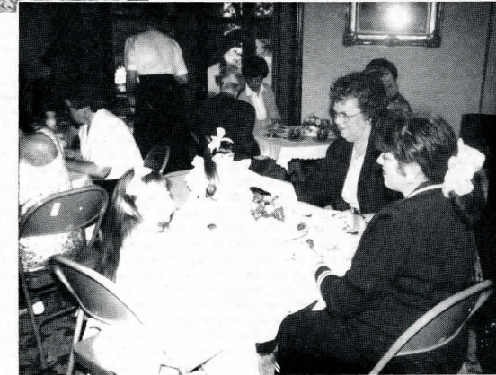
Scenes From The Parlor