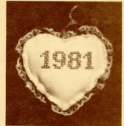
The annual ornament is a counted cross stitched snow flake with 1981 on the reverse side.