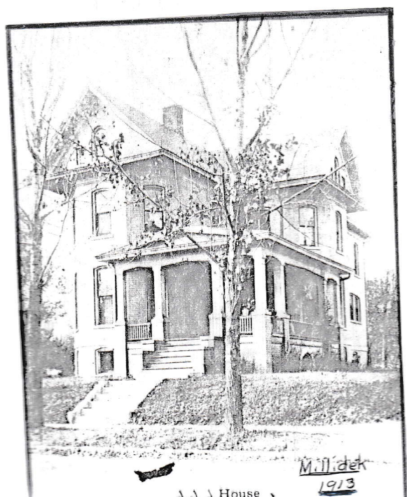
Δ Δ Δ House