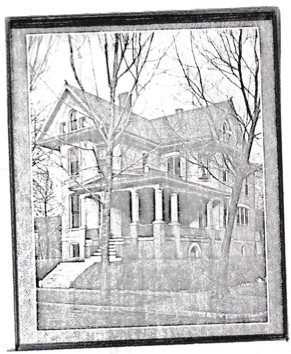
X Δ Φ