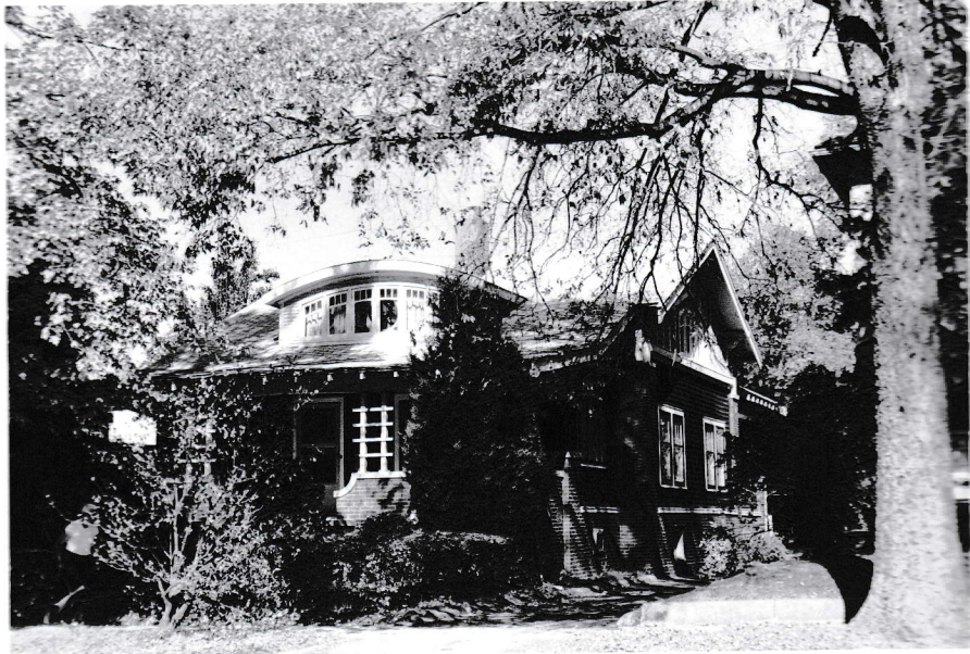
360 West Decatur Street