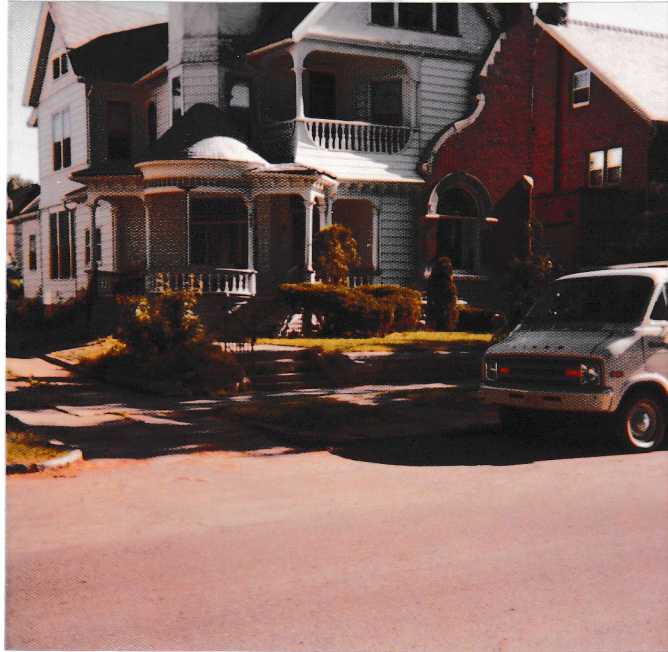
Pinote - A.B. Meyer - April, 1976 442 West Prairie Lew Residential