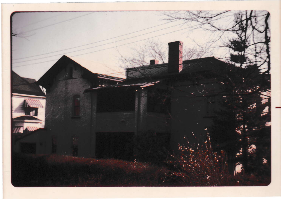
December, 1974