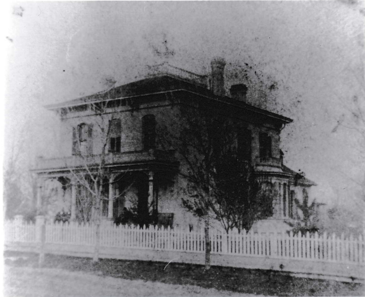
Date unknown