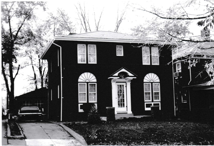
1945 West Wood Street