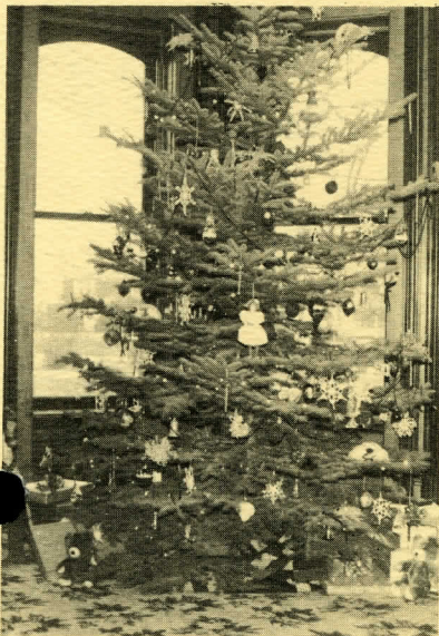
The tree, brought from Wisconsin, displayed the Homestead's collection of Victorian ornaments.